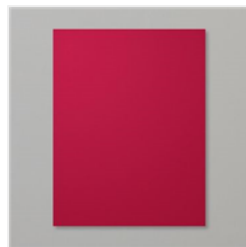
Cherry Cobbler 8-1/2" X 11" Cardstock - 119685