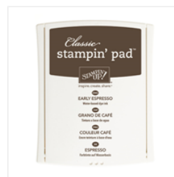
Early Espresso Classic Stampin' Pad - 126974