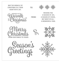
Snowflake Sentiments Wood-Mount Stamp Set - 144817