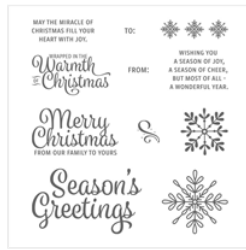
Snowflake Sentiments Clear-Mount Stamp Set - 144820