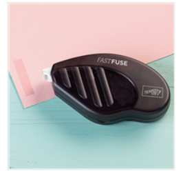
Fast Fuse Adhesive - 129026