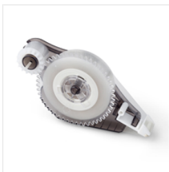
Fast Fuse Adhesive Refill - 129027