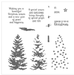
Season Like Christmas Photopolymer Stamp Set* - 144860