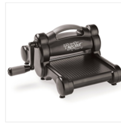
Big Shot - 143263