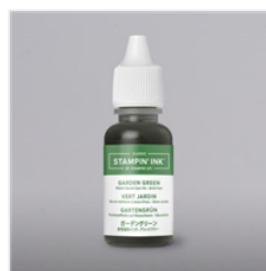
Garden Green Classic Stampin' Ink Refill - 102059