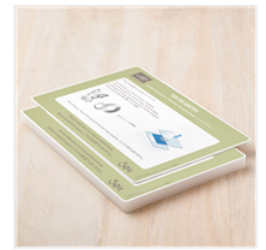
Big Shot Platform - 142802