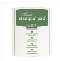
Garden Green Classic Stampin' Pad - 126973