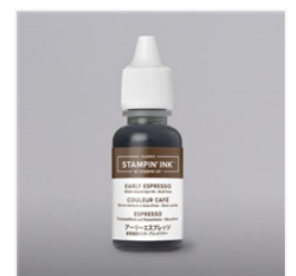
Early Espresso Classic Stampin' Ink Refill - 119789