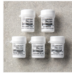
Brusho Crystal Colour - 144101