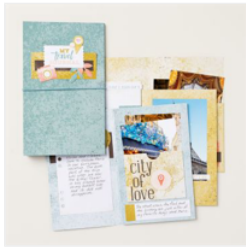
The Scenic Route Travel Journal Kit - 163904