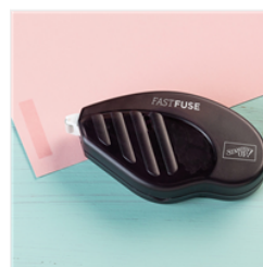
Fast Fuse Adhesive - 129026