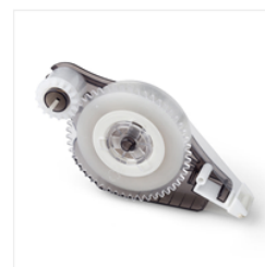
Fast Fuse Adhesive Refill - 129027