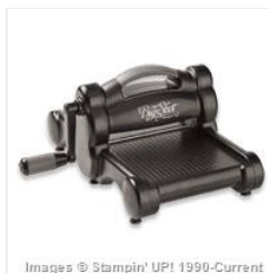
Big Shot - 113439