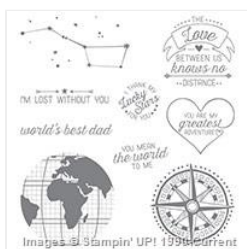
Going Global Clear-Mount Stamp Set - 140748