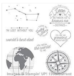
Going Global Wood-Mount Stamp Set - 140745

stampwithmarybush@yahoo.com www.stampinthesand.stampinup.net