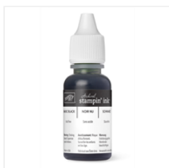
Basic Black Archival Stampin' Ink Refill - 140928