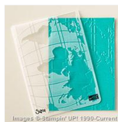
World Traveler Textured Impressions Embossing Folder - 138289