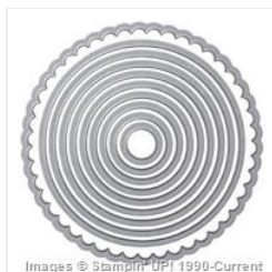
Circles Collection Framelits Dies - 130911