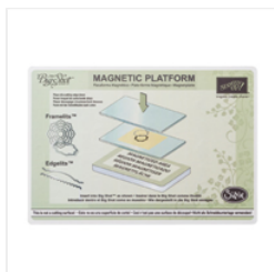
Magnetic Platform - 130658