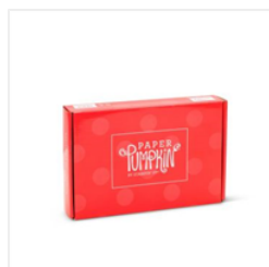
Prepaid Paper Pumpkin Subscription 1-Month - 137858