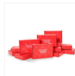
Prepaid Paper Pumpkin Subscription 12-Month - 137861