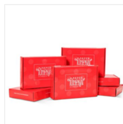
Prepaid Paper Pumpkin Subscription 6-Month - 137860