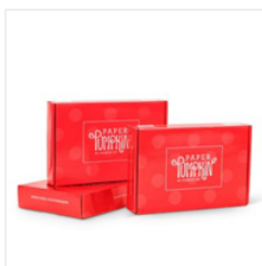
Prepaid Paper Pumpkin Subscription 3-Month - 137859