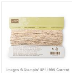
Metallic Gold Baker's Twine - 132975