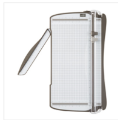
Stampin' Trimmer - 126889