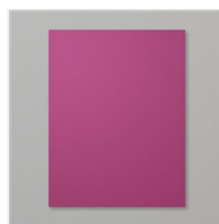
Rich Razzleberry 8-1/2" X 11" Cardstock - 115316