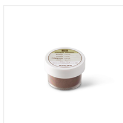
Copper Stampin' Emboss Powder - 141636