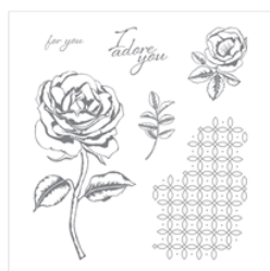
Graceful Garden Clear-Mount Stamp Set - 143849