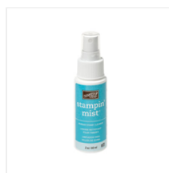
Stampin' Mist - 102394