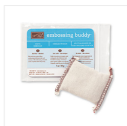
Embossing Buddy - 103083