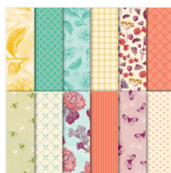
Tea Room Specialty Designer Series Paper - 146894