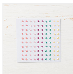
Share What You Love Artisan Pearls - 146927