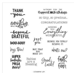
Charming Sentiments Photopolymer Stamp Set (English) - 159985