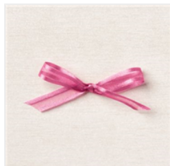
Polished Pink 3/8" (1 Cm) Open Weave Ribbon - 155714