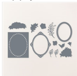
Framed Florets Dies - 160623