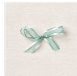
Soft Succulent 3/8" (1 Cm) Open Weave Ribbon - 155780