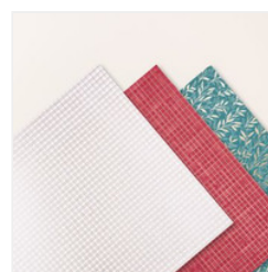
Regal Distressed Patterns 12" X 12" (30.5 X 30.5 Cm) Specialty Designer Series Paper - 164037