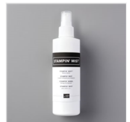
Stampin' Mist - 153648