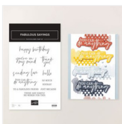
Fabulous Sayings Photopolymer Stamp Set (English) - 167972