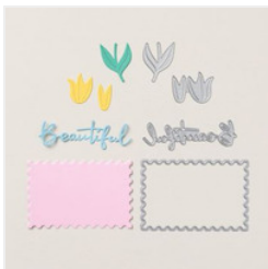
Beautiful Blooms Dies (English) - 168666