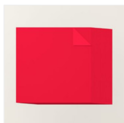
Poppy Parade 12" X 12" (30.5 X 30.5 Cm) Two-Tone Cardstock - 166692