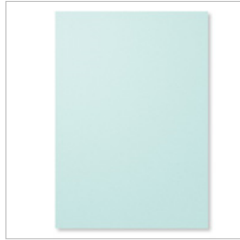
Soft Sky A4 Cardstock