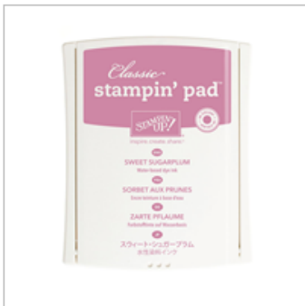
Sweet Sugarplum Classic Stampin' Pad