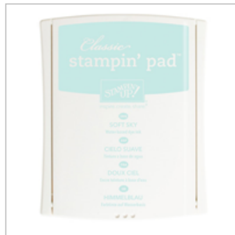
Soft Sky Classic Stampin' Pad