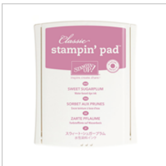
Sweet Sugarplum Classic Stampin' Pad