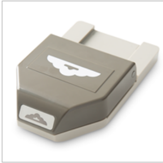
Scalloped Tag Topper