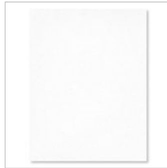
Shimmery White A4 Cardstock