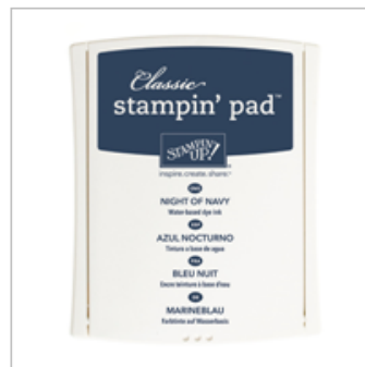
Night Of Navy Classic Stampin' Pad