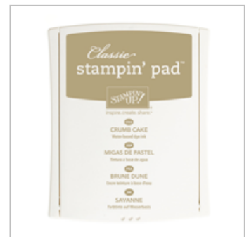
Crumb Cake Classic Stampin' Pad