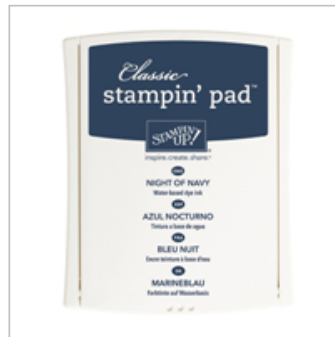
Night Of Navy Classic Stampin' Pad