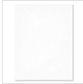
Shimmery White A4 Cardstock