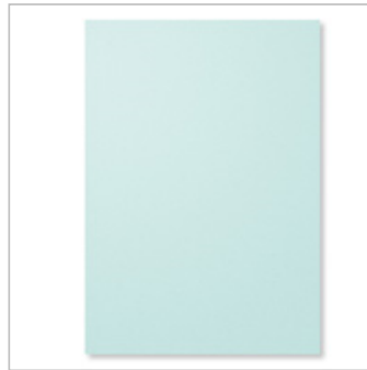
Soft Sky A4 Cardstock