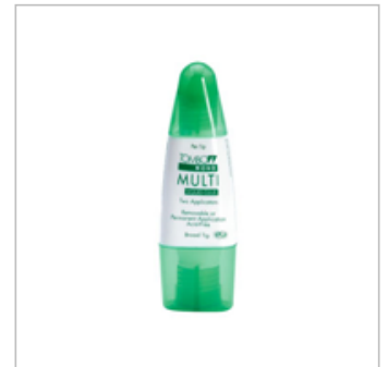
Multipurpose Liquid Glue