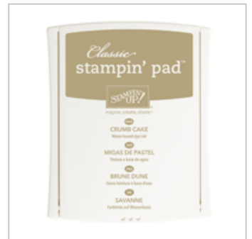
Crumb Cake Classic Stampin' Pad