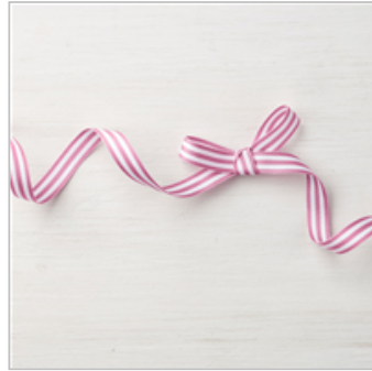
Sweet Sugarplum 3/8"