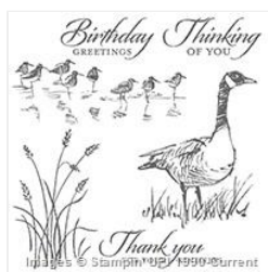
Wetlands Clear-Mount Stamp Set - 126697