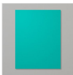
Bermuda Bay 8-1/2\" X 11\" Cardstock - 131197