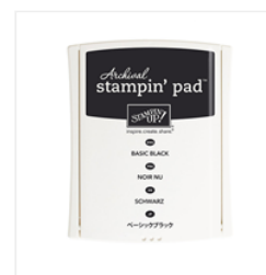
Basic Black Archival Stampin' Pad - 140931