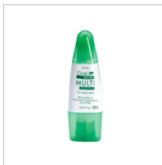
Multipurpose Liquid Glue