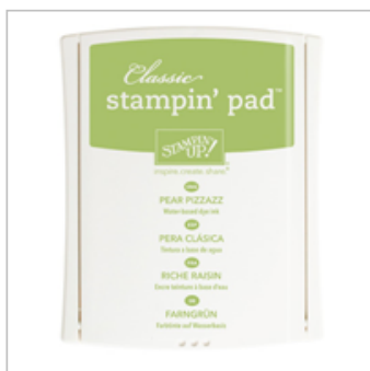
Pear Pizzazz Classic Stampin' Pad