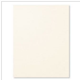
Very Vanilla A4 Cardstock