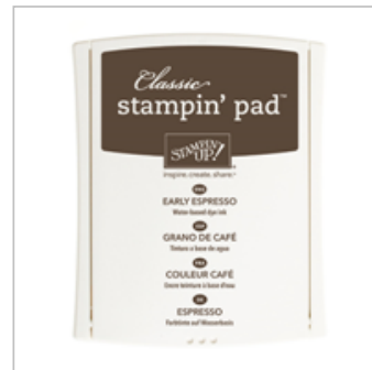
Early Espresso Classic Stampin' Pad