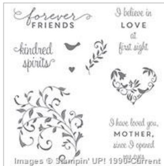
First Sight Clear- Mount Stamp Set