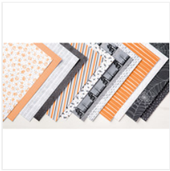
Halloween Night Specialty Designer Series Paper - 142022