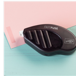
Fast Fuse Adhesive - 129026