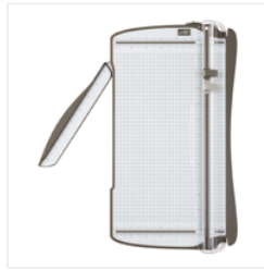
Stampin' Trimmer - 126889