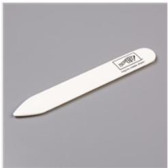
Bone Folder - 102300