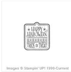
Halloween Treat Wood-Mount Stamp Set - 142249