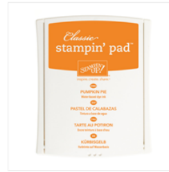
Pumpkin Pie Classic Stampin' Pad - 126945