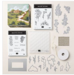
Beautiful Gallery Suite Collection (English) - 165217