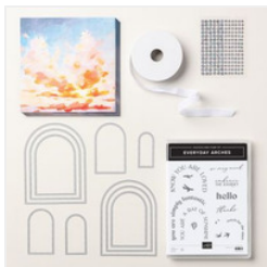
Everyday Skies Suite Collection (English) - 164635