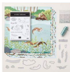
Otterly Adorable Suite Collection (English) - 164939