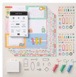
On The Go Suite Collection (English) - 165583