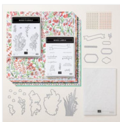
Mixed Media Florals Suite Collection (English) - 164659