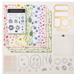
Floral Impressions Suite Collection (English) - 165617