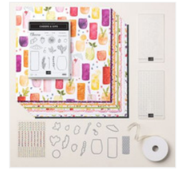
Celebratory Sips Suite Collection (English) - 165600