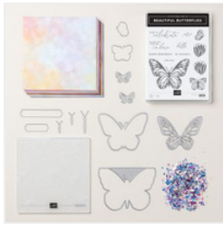
Beautiful Bokeh Suite Collection (English) - 164619