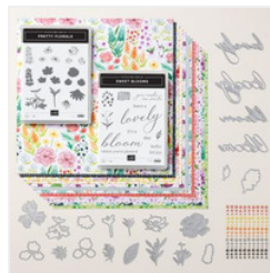
Florals In Bloom Suite Collection (English) - 165193