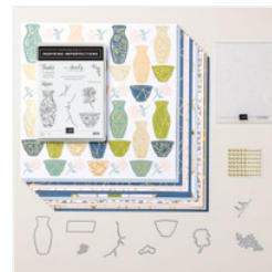
Kintsugi Inspirations Suite Collection (English) - 165172