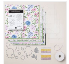
Lovely Garden Suite Collection (English) - 165541