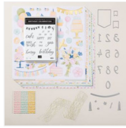
Wildflower Birthday Suite Collection (English) - 164604