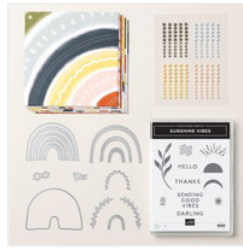
Boho Vibes Suite Collection (English) - 165156