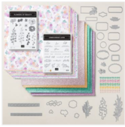
Unbounded Beauty Suite Collection (English) - 163390