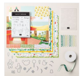
Turtle-Y Cute Suite Collection (English) - 165235