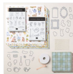
Storybook Moments Suite Collection (English) - 164681