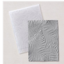
Fern 3D Embossing Folder - 158804