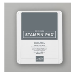
Basic Gray Classic Stampin' Pad - 149165