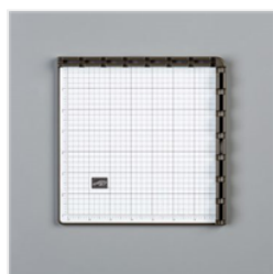
Stamparatus - 146276