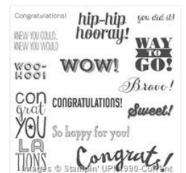
Bravo Photopolymer Stamp Set - 135380