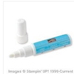
2-Way Glue Pen - 100425