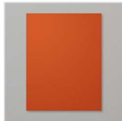
Cajun Craze 8-1/2 X 11 Cardstock - 119684