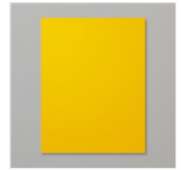
Crushed Curry 8-1/2 X 11 Cardstock - 131199