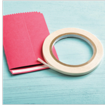
Tear & Tape Adhesive