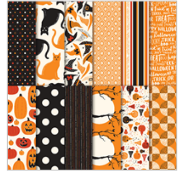
Spooky Night Designer Series