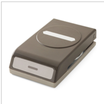
Classic Label Punch