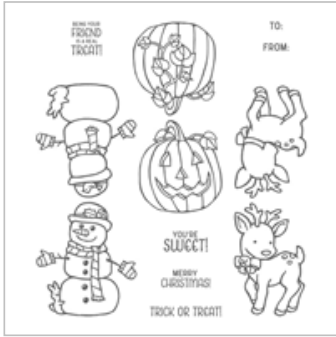
Seasonal Chums Clear-Mount Stamp