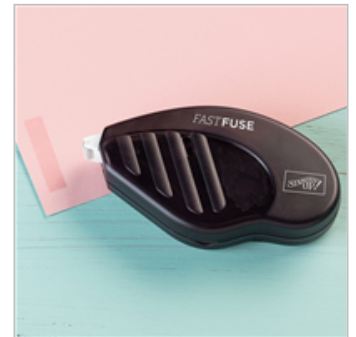
Fast Fuse Adhesive