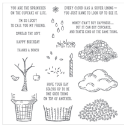
Sprinkles Of Life Photopolymer Stamp Set - 139971

stampswellwithothers@gmail.com http://donnas-stampswellwithothers.blogspot.com/