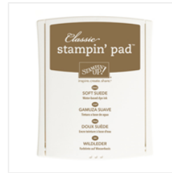
Soft Suede Classic Stampin' Pad - 126978