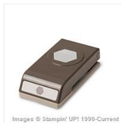
Hexagon Punch - 130919