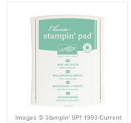
Mint Macaron Classic Stampin' Pad - 138326