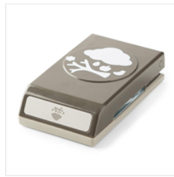
Tree Builder Punch - 138295