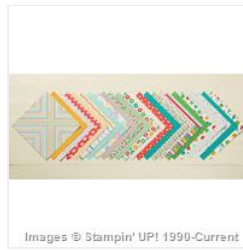
Cherry On Top Designer Series Paper Stack - 138443