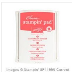
Watermelon Wonder Classic Stampin' Pad - 138323