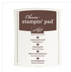
Chocolate Chip Classic Stampin' Pad - 126979