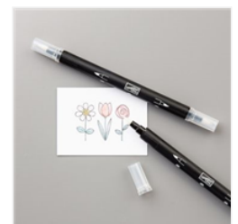
Blender Pens - 102845