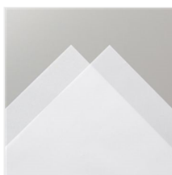
Vellum A4 Cardstock - 106584