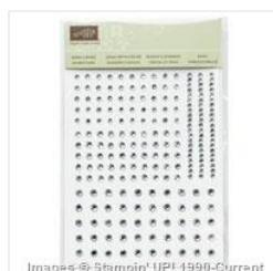
Rhinestone Basic Jewels - 119246