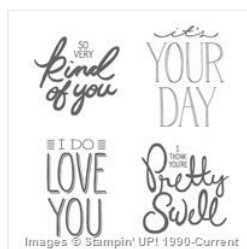
Big On You Photopolymer Stamp Set - 137151