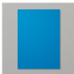
Pacific Point A4 Cardstock - 116202