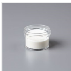
Clear Stampin' Emboss Powder - 109130