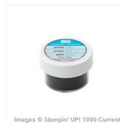
Black Stampin' Emboss Powder - 109133