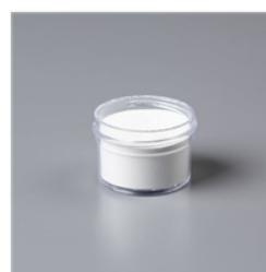
White Stampin' Emboss Powder - 109132