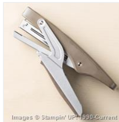
Handheld Stapler - 135850