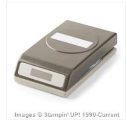
Washi Label Punch - 138296