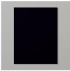
Basic Black 8-1/2" X 11" Cardstock - 121045