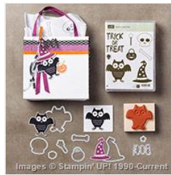
Howl-O-Ween Treat Wood-Mount Bundle - 140839