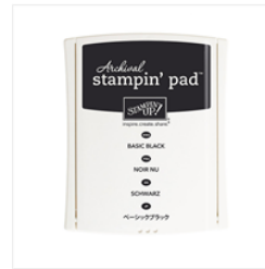
Basic Black Archival Stampin' Pad - 140931