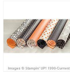
Happy Haunting Designer Series Paper - 139584