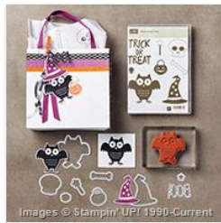
Howl-O-Ween Treat Clear-Mount Bundle - 140840