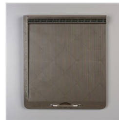
Simply Scored Scoring Tool - 122334