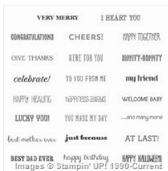
And Many More Wood-Mount Stamp Set - 134273