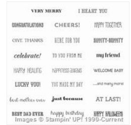
And Many More Clear-Mount Stamp Set - 134276