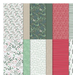
Tidings Of Christmas 6" X 6" (15.2 X 15.2 Cm) Designer Series Paper - 155718