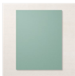
Soft Succulent 8-1/2" X 11" Cardstock - 155776