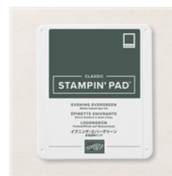
Evening Evergreen Classic Stampin' Pad - 155576