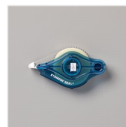
Stampin' Seal+ Refill - 152812