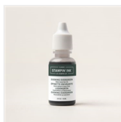
Evening Evergreen Classic Stampin' Ink Refill - 155577