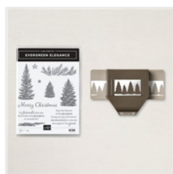
Evergreen Elegance Bundle (English) - 155579