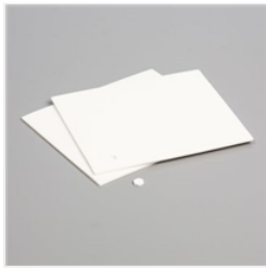
Mini Stampin' Dimensionals - 144108