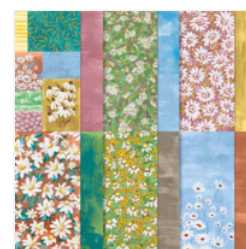
Fresh As A Daisy 12" X 12" (30.5 X 30.5 Cm) Designer Series Paper - 161289