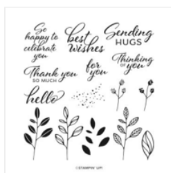
Layering Leaves Photopolymer Stamp Set (English) - 161277