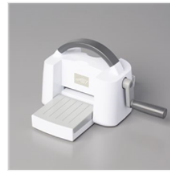
Mini Stampin' Cut & Emboss Machine - 150673