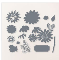
Cheerful Daisies Dies - 161296