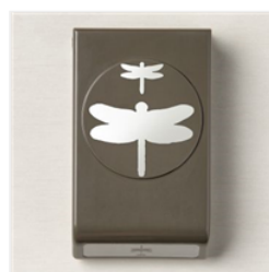
Dragonflies Punch - 154240