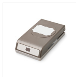
Decorative Label Punch - 120907