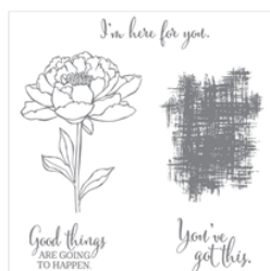
You've Got This Wood-Mount Stamp Set - 139572

stampswellwithothers@gmail.com http://donnas-stampswellwithothers.blogspot.com/