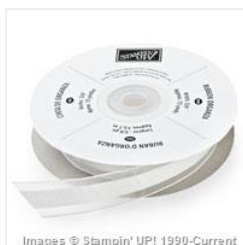
Whisper White 5/8" (1.6 Cm) Organza Ribbon - 114319