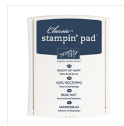
Night Of Navy Classic Stampin' Pad - 126970