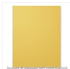
Hello Honey 8-1/2" X 11" Cardstock - 133678