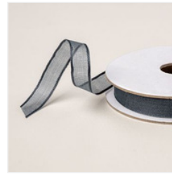
Secret Sea 3/8" (1 Cm) Bordered Open Weave Ribbon - 166932