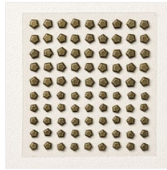
Faux Bronze Pentagons - 166931