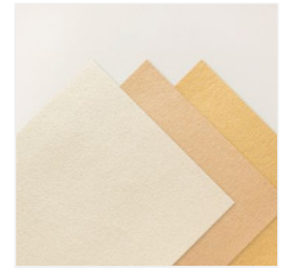
Natural Hues 12" X 12" (30.5 X 30.5 Cm) Textured Specialty Paper - 166929