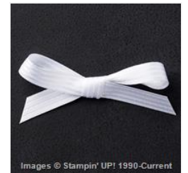
Whisper White 3/8"