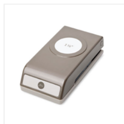
1-3/8" (3.5 Cm) Circle Punch - 119860