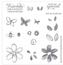
Garden In Bloom