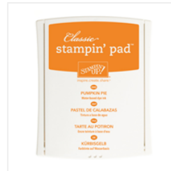
Pumpkin Pie Classic Stampin' Pad - 126945