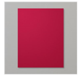
Cherry Cobbler 8-