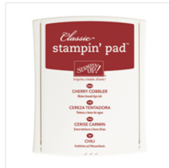
Cherry Cobbler Classic Stampin' Pad - 126966