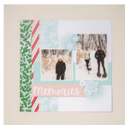
Snow Day Scrapbooking Workshop Kit (English) - 166489