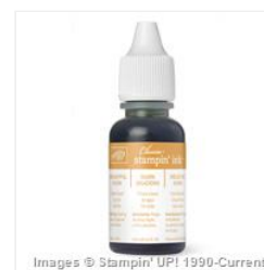
Delightful Dijon Classic Stampin' Ink Refill - 138332