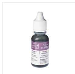
Perfect Plum Classic Stampin' Ink Refill - 102107