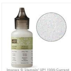
Dazzling Details - 124117