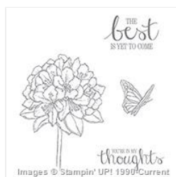
Best Thoughts Wood-Mount Stamp Set - 139234