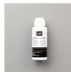
Stazon Cleaner - 109196