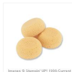
Stamping Sponges - 101610