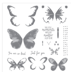
Watercolor Wings Photopolymer Stamp Set - 139424