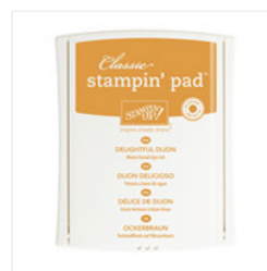
Delightful Dijon Classic Stampin' Pad - 138327