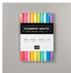
Brights Stampin' Write Markers - 147157