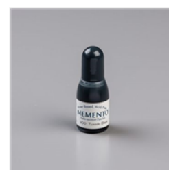
Tuxedo Black Memento Ink Refill - 133456