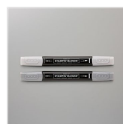
Smokey Slate Stampin' Blends Markers Combo Pack - 145058