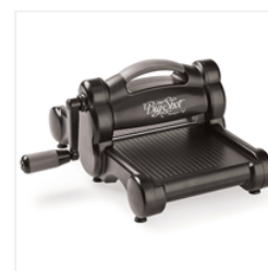
Big Shot - 143263