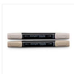
Crumb Cake Stampin' Blends Markers Combo Pack - 144601