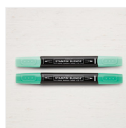
Call Me Clover Stampin' Blends Markers Combo Pack - 147282