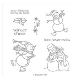
Spirited Snowmen Clear-Mount Stamp Set - 148072