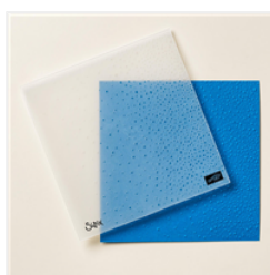
Softly Falling Textured Impressions Embossing Folder - 139672