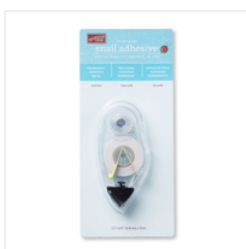
Snail Adhesive Refill - 104331