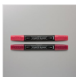
Cherry Cobbler Stampin' Blends Markers Combo Pack - 144598