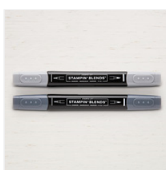
Basic Black Stampin' Blends Markers Combo Pack - 147942