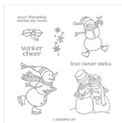
Spirited Snowmen Wood-Mount Stamp Set - 148075