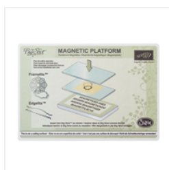
Magnetic Platform - 130658