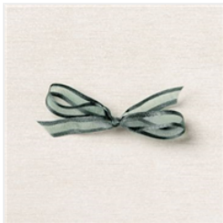
Evening Evergreen 3/8" (1 Cm) Open Weave Ribbon - 155573