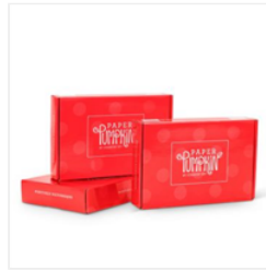
Prepaid Paper Pumpkin Subscription 3- Month - 137859