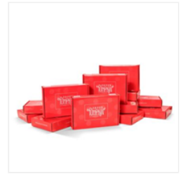
Prepaid Paper Pumpkin Subscription 12- Month - 137861