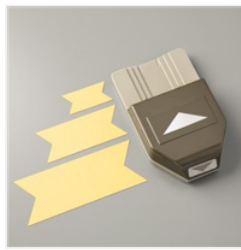
Triple Banner Punch - 138292