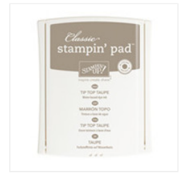
Tip Top Taupe Classic Stampin' Pad - 138325