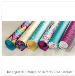
Bohemian Designer Series Paper - 138446