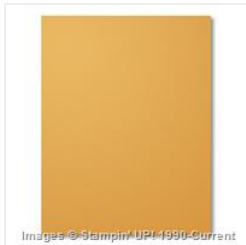
Delightful Dijon 8- 1/2" X 11" Cardstock - 138338