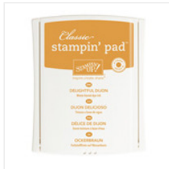
Delightful Dijon Classic Stampin' Pad - 138327