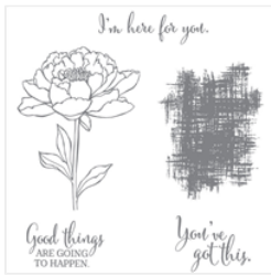
You've Got This Clear-Mount Stamp Set - 139575