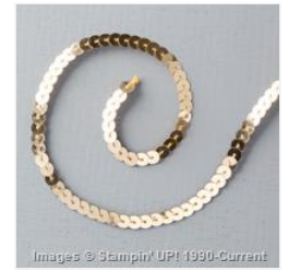
Gold Sequin Trim - 132983