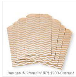
Chevron Tag A Bag Gift Bags - 131370