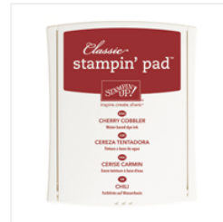
Cherry Cobbler Classic Stampin' Pad - 126966