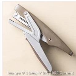
Handheld Stapler - 135850