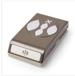
Festive Flower Builder Punch - 139682