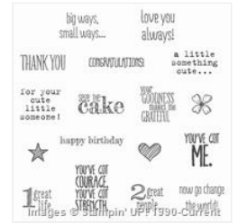
Something To Say Wood-Mount Stamp Set - 134177