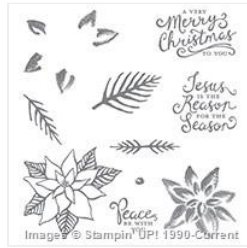
Reason For The Season Photopolymer Stamp Set - 139730