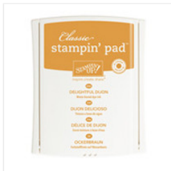
Delightful Dijon Classic Stampin' Pad - 138327