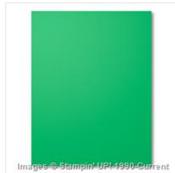
Cucumber Crush 8-1/2" X 11" Cardstock - 138335