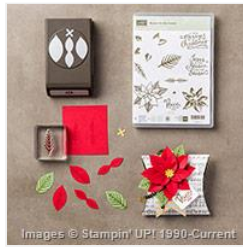
Reason For The Season Photopolymer Bundle - 140847