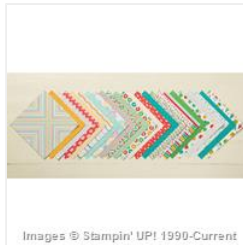
Cherry On Top Designer Series Paper Stack - 138443