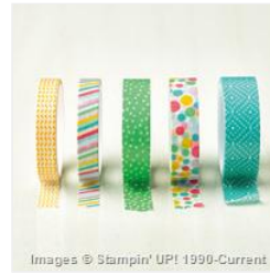
Cherry On Top Designer Washi Tape - 138384