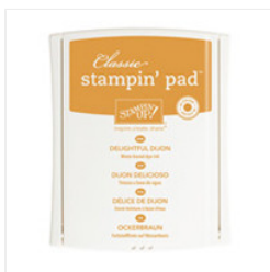
Delightful Dijon Classic Stampin' Pad - 138327