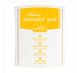
Crushed Curry Classic Stampin' Pad - 131173