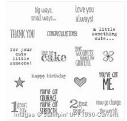
Something To Say Wood-Mount Stamp Set - 134177