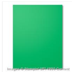
Cucumber Crush 8-1/2" X 11" Cardstock - 138335