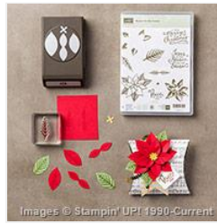
Reason For The Season Photopolymer Bundle - 140847