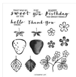
Sweet Strawberry Photopolymer Stamp Set - 154394