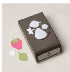
Strawberry Builder Punch - 154239