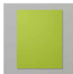
Granny Apple Green 8-1/2" X 11" Cardstock - 146990