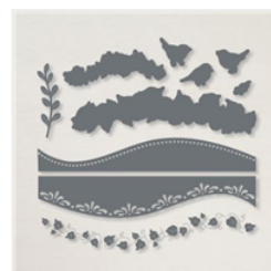
Curvy Dies - 154319