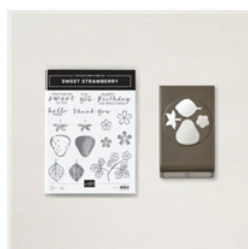
Sweet Strawberry Bundle (English) - 156214