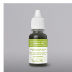
Granny Apple Green Classic Stampin' Ink Refill - 147163