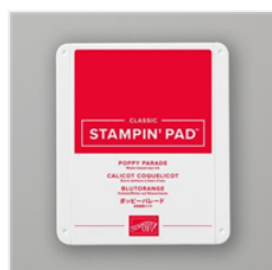
Poppy Parade Classic Stampin' Pad - 147050