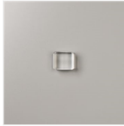
Clear Block A - 118487