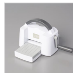
Mini Stampin' Cut & Emboss Machine - 150673