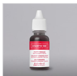
Poppy Parade Classic Stampin' Ink Refill - 119791