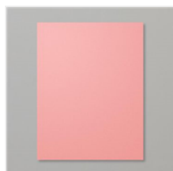
Flirty Flamingo 8-1/2" X 11" Cardstock - 141416