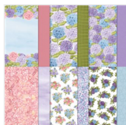
Hydrangea Hill Designer Series Paper - 154570