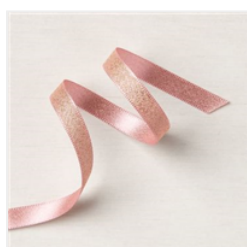
3/8 (1 Cm) Blushing Bride Metallic Ribbon - 154283