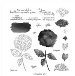
Hydrangea Haven Photopolymer Stamp Set - 154470