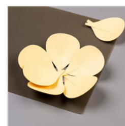
Silicone Craft Sheet - 127853