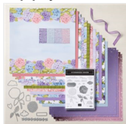
Hydrangea Hill Suite Collection (English) - 155985