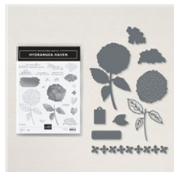
Hydrangea Haven Bundle (English) - 156251