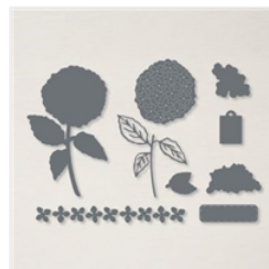
Hydrangea Dies - 154326