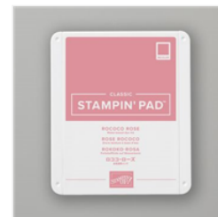
Rococo Rose Classic Stampin' Pad - 150080