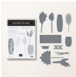
Earthen Textures Bundle (English) - 161514