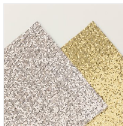
More Dazzle 6" X 6" (15.2 X 15.2 Cm) Specialty Paper - 161749