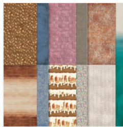
Earthen Elegance 12" X 12" (30.5 X 30.5 Cm) Designer Series Paper - 161503