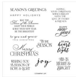
Brightest Glow Cling Stamp Set (English) - 159542