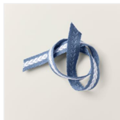
Misty Moonlight 3/8" (1 Cm) Inner Braid Ribbon - 161638