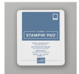
Misty Moonlight Classic Stampin' Pad - 153118