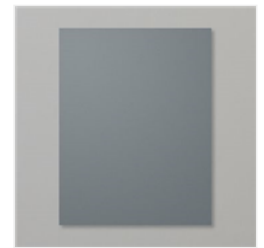
Basic Gray 8-1/2" X 11" Cardstock - 121044