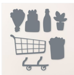
Attention Shoppers Dies - 163643