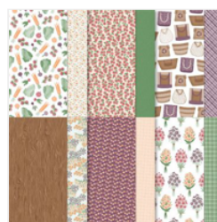
To Market 12" X 12" (30.5 X 30.5 Cm) Designer Series Paper - 163421