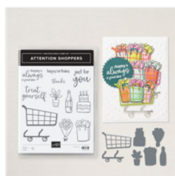
Attention Shoppers Bundle (English) - 163644