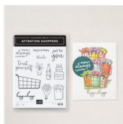
Attention Shoppers Photopolymer Stamp Set (English) - 163640