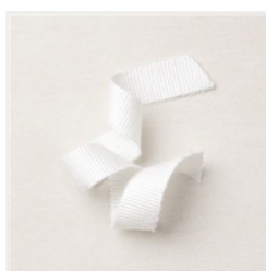
White 3/4" (1.9 Cm) Frayed Ribbon - 158138