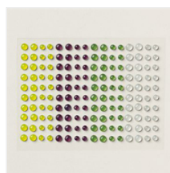
Transparent Adhesive-Backed Dots - 163432