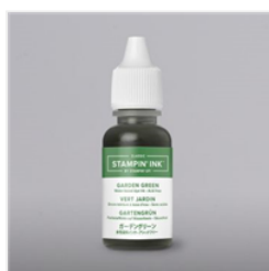
Garden Green Classic Stampin' Ink Refill - 102059