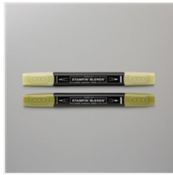
Old Olive Stampin' Blends Combo Pack - 154892