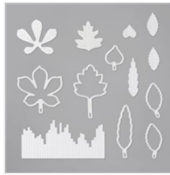
Stitched Leaves Dies - 153567