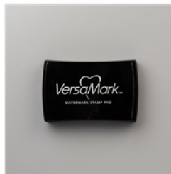
Versamark Pad - 102283