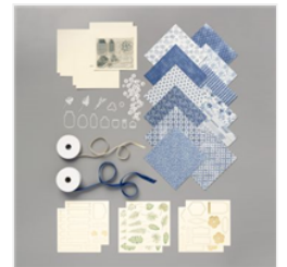
Boho Indigo Product Medley (En) - 153132