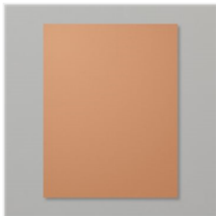
Cinnamon Cider 8-1/2" X 11" Cardstock - 153078