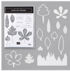
Love Of Leaves Bundle (English) - 155195

agranger21@outlook.com www.stampwithanne.com