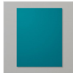
Pretty Peacock 8-1/2" X 11" Cardstock - 150880