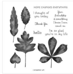
Love Of Leaves Photopolymer Stamp Set (English) - 153452