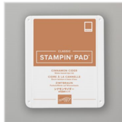
Cinnamon Cider Classic Stampin' Pad - 153114