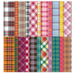
Plaid Tidings 6" X 6" (15.2 X 15.2 Cm) Designer Series Paper - 153527