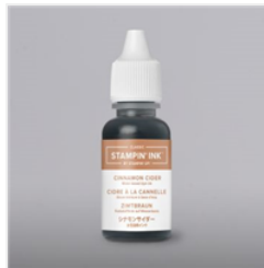
Cinnamon Cider Classic Stampin' Ink Refill - 153120