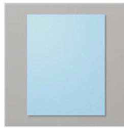
Balmy Blue 8-1/2" X 11" Cardstock - 146982