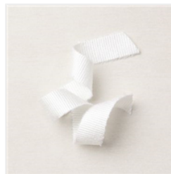
White 3/4" (1.9 Cm) Frayed Ribbon - 158138