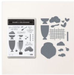
Share A Milkshake Bundle (English) - 160396