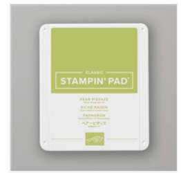
Pear Pizzazz Classic Stampin' Pad - 147104