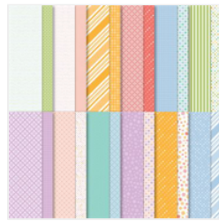
Dandy Designs 12" X 12" (30.5 X 30.5 Cm) Designer Series Paper - 160836