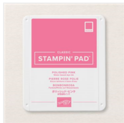
Polished Pink Classic Stampin' Pad - 155712