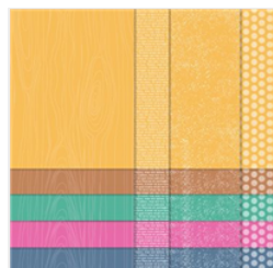
2020-2022 In Color™ 6" X 6" (15.2 X 15.2 Cm) Designer Series Paper - 153070