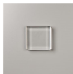
Clear Block D - 118485