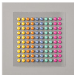
2020-2022 In Color Enamel Dots - 152480