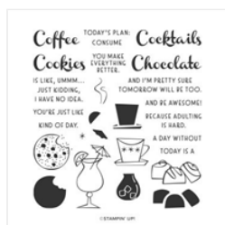
Nothing's Better Than Photopolymer Stamp Set (En) - 152507