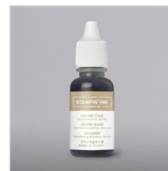
Crumb Cake Classic Stampin' Ink Refill - 121029