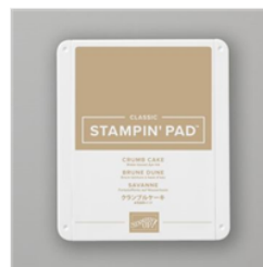
Crumb Cake Classic Stampin' Pad - 147116