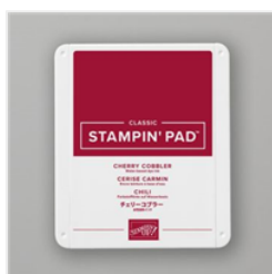
Cherry Cobbler Classic Stampin' Pad - 147083