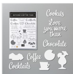
Nothing's Better Than Bundle (En) - 154061