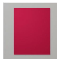
Cherry Cobbler 8-1/2" X 11" Cardstock - 119685