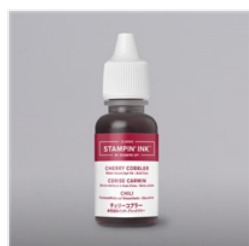
Cherry Cobbler Classic Stampin' Ink Refill - 119788