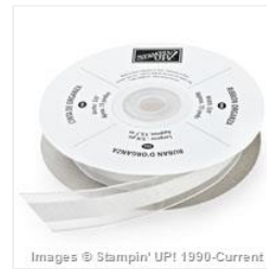
Whisper White 5/8" (1.6 Cm) Organza Ribbon - 114319