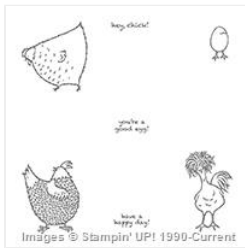
Hey Chick Clear Mount Stamp Set - 143331

astampingteddy@gmail.com http://stampingincolumbusga.blogspot.com/