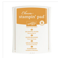
Delightful Dijon Classic Stampin' Pad - 138327