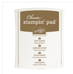
Soft Suede Classic Stampin' Pad - 126978