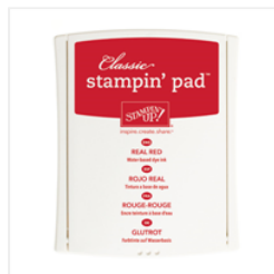
Real Red Classic Stampin' Pad - 126949