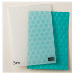
Hexagons Dynamic Textured Impressions Embossing Folder - 143231