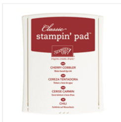
Cherry Cobbler Classic Stampin' Pad - 126966