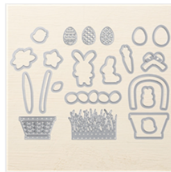
Basket Builder Framelits Dies - 143228