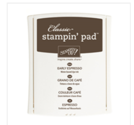
Early Espresso Classic Stampin' Pad - 126974