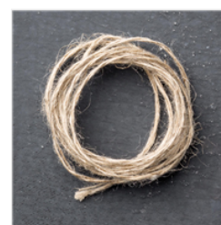
Linen Thread - 104199