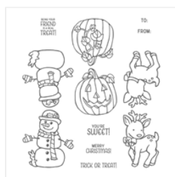
Seasonal Chums Wood-Mount Stamp Set - 144945