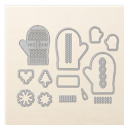
Many Mittens Framelits Dies - 144672