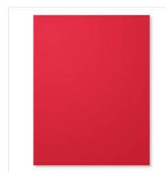
Real Red 8-1/2" X 11" Cardstock - 102482