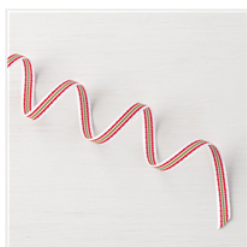
Quilted Christmas 1/4" (6.4 Mm) Ribbon - 144620