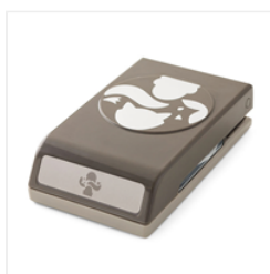
Fox Builder Punch - 141470