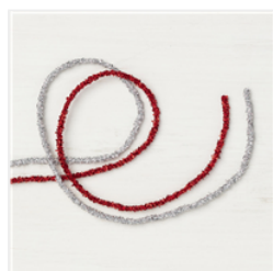
Mini Tinsel Trim Combo Pack - 144636