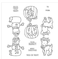
Seasonal Chums Clear-Mount Stamp Set - 144948