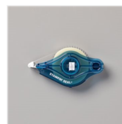
Stampin' Seal+ Refill - 152812