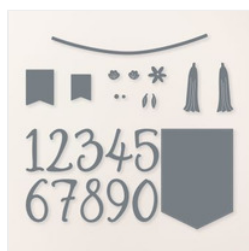
Birthday Celebration Dies - 164598

stampwithmarybush@yahoo.com www.stampinthesand.stampinup.net