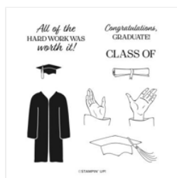
Cap & Gown Cling Stamp Set (English) - 162810