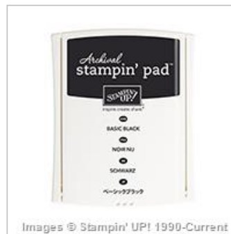
Basic Black Archival Stampin' Pad