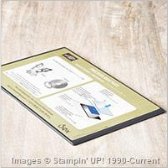
Precision Base Plate