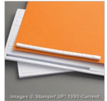
Foam Adhesive Strips