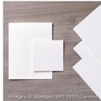
Whisper White A4 Thick Cardstock