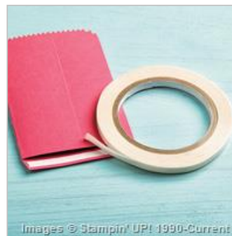
Tear & Tape