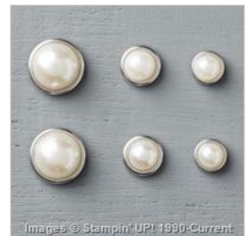
Metal Rimmed Pearls