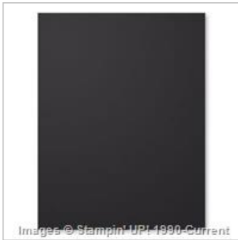
Basic Black A4 Cardstock