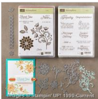
Flourishing Phrases Clear-Mount Bundle