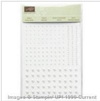
Pearl Basic Jewels

Angela Westland bobby59@live.com.au angetreasures.blogspot.com.au/