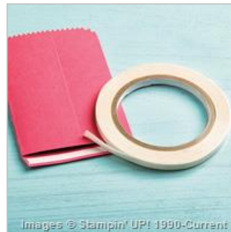
Tear & Tape Adhesive