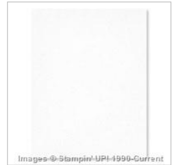
Shimmery White A4 Cardstock