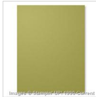
Old Olive A4 Cardstock