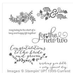
For The New Two Clear-Mount Stamp Set - 138562

boser@paulbunyan.net www.tinkerin-in-ink.blogspot.com