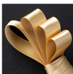
Gold 5/8" (1.6 Cm) Satin Ribbon - 134547