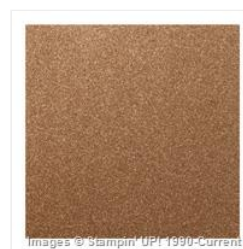
Champagne Glimmer Paper - 127885