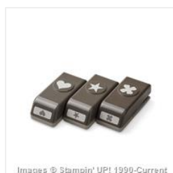
Itty Bitty Accents Punch Pack - 133787