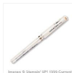
White Signo Uni- Ball Gel Pen - 105021