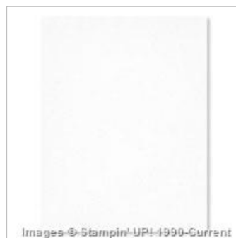
Shimmery White A4 Cardstock