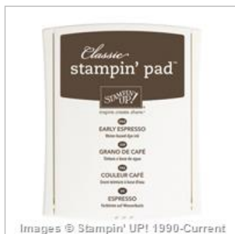
Early Espresso Classic Stampin' Pad

Angela Westland bobby59@live.com.au angetreasures.blogspot.com.au/