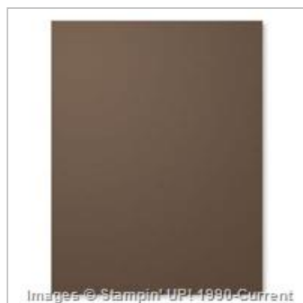
Early Espresso A4 Cardstock