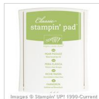
Pear Pizzazz Classic Stampin' Pad