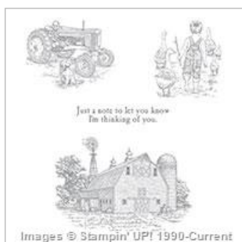
Heartland Clear- Mount Stamp Set