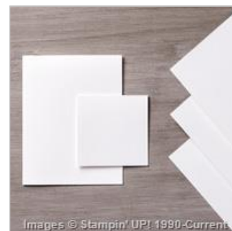
Whisper White A4 Thick Cardstock