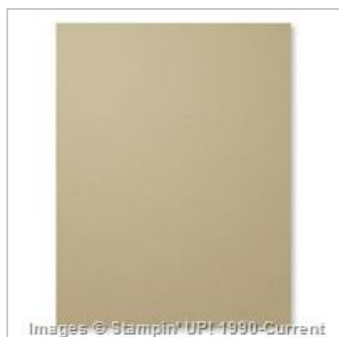
Crumb Cake A4 Cardstock