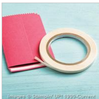
Tear & Tape Adhesive