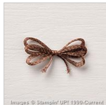
1/4" Copper Trim