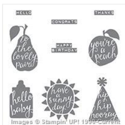
Silhouettes & Script Clear-Mount Stamp Set - 139940 Price: $13.00