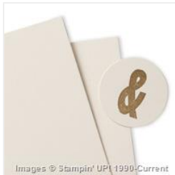
Vanilla Coaster Board - 129392 Price: $7.50