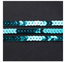
Bermuda Bay Sequin Trim - 137910 Price: $6.75