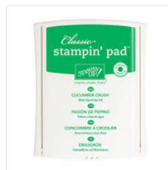
Cucumber Crush Classic Stampin' Pad - 138324 Price: $8.50