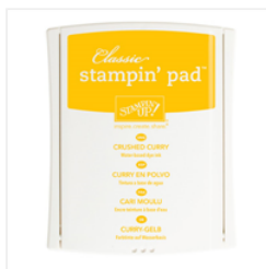
Crushed Curry Classic Stampin' Pad - 131173 Price: $8.50