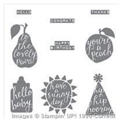
Silhouettes & Script Wood-Mount Stamp - 139179 Price: $17.00