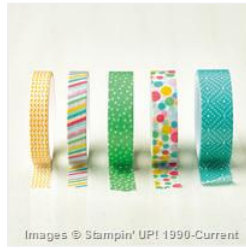
Cherry On Top Designer Washi Tape - 138384 Price: $10.00