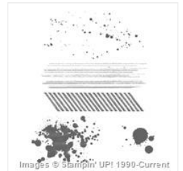
Gorgeous Grunge Wood-Mount Stamp Set - 130514 Price: $33.00