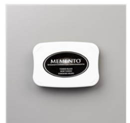
Tuxedo Black Memento Ink Pad - 132708 Price: $11.00