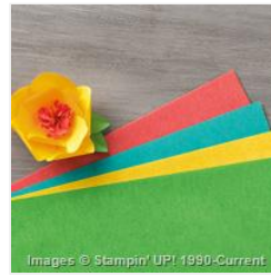
Cherry On Top Cotton Paper Assortment - 138308 Price: $8.75