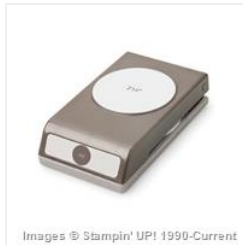
2-1/2" Circle Punch - 120906 Price: $22.00