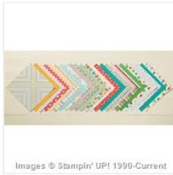
Cherry On Top Designer Series Paper Stack - 138443 Price: $10.00