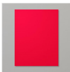
Poppy Parade 8-1/2" X 11" Cardstock - 119793