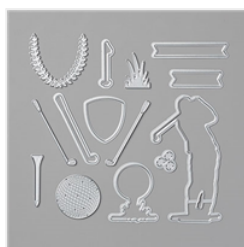
Golf Club Dies - 151580