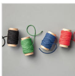
Country Club Twine Combo Pack - 151318