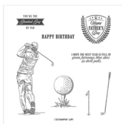
Clubhouse Cling Stamp Set - 151583