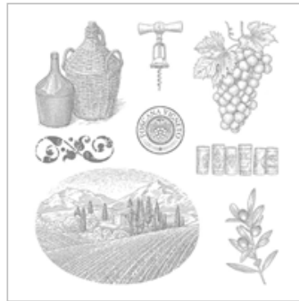
Tuscan Vineyard Wood-Mount Stamp