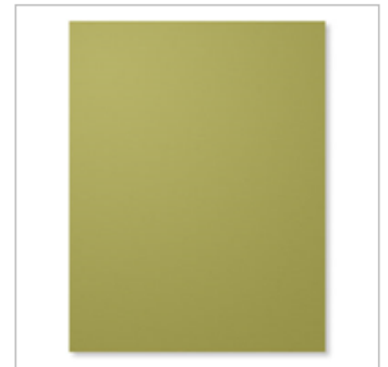
Old Olive 8-1/2" X 11"