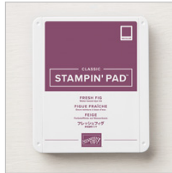
Fresh Fig Classic Stampin' Pad