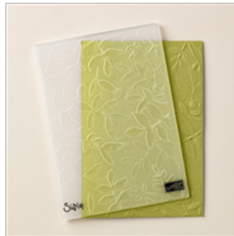
Layered Leaves Dynamic Textured Impressions Embossing Folder