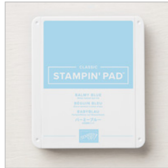
Balmy Blue Classic Stampin' Pad