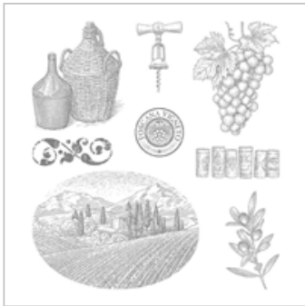
Tuscan Vineyard Clear-Mount Stamp