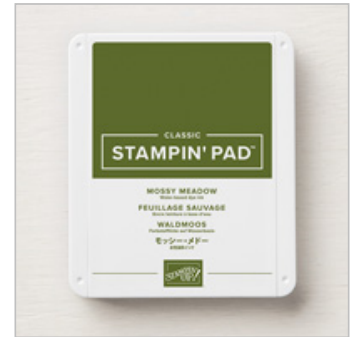
Mossy Meadow Classic Stampin' Pad